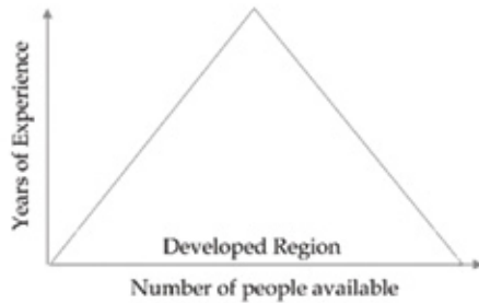
Figure 3: Skills pyramids in developed regions

Finally, since this topic comes up a lot in terms of selecting outsource development organizations, let's talk about what accreditation under CMMI or some other similar development process model does--and does not--tell you about testing and quality. To start with, let me say that I am not opposed to process formalization programs such as CMMI. I believe that they can result in quality improvement, when used properly. However, even Bill Curtis of the Software Engineering Institute admitted (at ASM/SM 2002 conference) that, when used purely as a marketing device, CMM does not result in significant quality or efficiency improvements 2 .