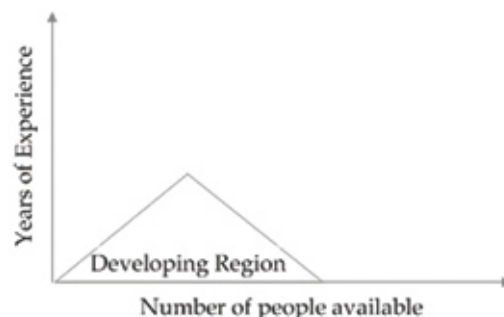
Figure 2: Skills pyramids in developing regions

This creates a real issue for testing in two ways. First, the outsource organization will tend to lack of deep skills and experience in fields that require them, such as performance testing, reliability testing, and test management. The problem is especially acute in terms of a lack of seasoned test managers, the kind of people who have been through dozens of projects and have a good ability to intuit and manage sources of test project risks. Second, because of the lack of deep skills and experience, outsource test teams in developing regions tend to lack the access to mentoring by highly skilled and experienced staff that people take for granted in developed regions.