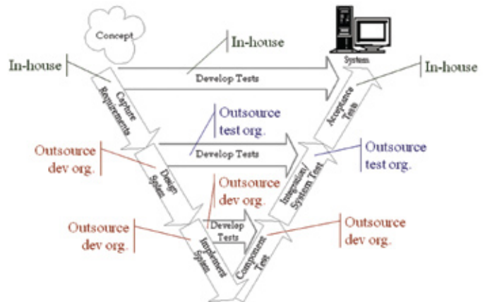
Figure 4: Carving up the test activities on an outsourced project

Let's start with carving up the main testing activities. To do so, you'll need to refer to the lifecycle model that you are following. For the moment, let's assume you're following the V-model approach mentioned earlier. If so, then the division of work shown in Figure 4 makes sense. Combined with the project management and change management elements shown in Figure 1, you now have a model for knowing who is suppose to do what work when, and a way for measuring progress against major milestones and managing the inevitable changes that will occur.